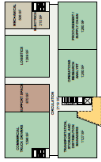
SECOND FLOOR - 9960 SF